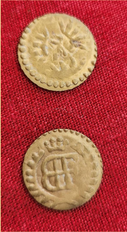
Site Token (by Reinhold von Glier)