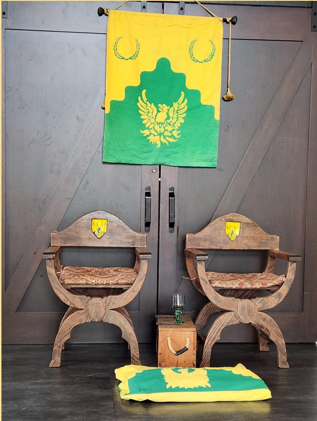
Fenix thrones from 12 th Night 2024