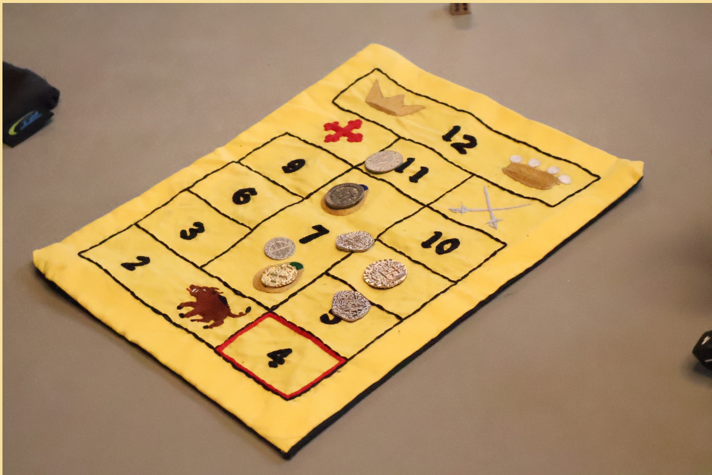
Photo of an embroidered Gluckhaus board, made by Roisin de Burgh